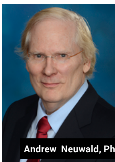
Andrew Neuwald, PhD

Professor of Biochemistry and Molecular Biology and IGS Faculty at UMSOM, develops and applies computational approaches for protein sequence/structural analysis. He aims to identify sequence and structural determinants of protein function and to thereby better understand how proteins work at the molecular level. He recently developed several new tools: Structurally Interacting Pattern Residues' Inferred Significance (SIPRIS) , which identifies networks of structurally interacting protein residues likely responsible for functional specificity; Statistical Tool for Analysis of Residue Couplings (STARC) , which assesses the correspondence between sequence correlations and residue-to-residue 3D-contacts; Deep Analysis of Residue Constraints (DARC) , which concurrently characterizes residue