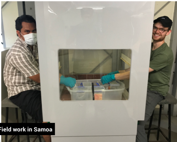
Field work in Samoa